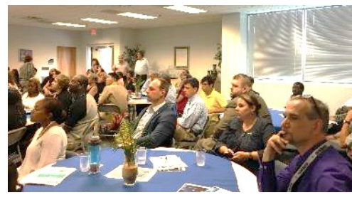
Cyber Workshop on Internships and Apprenticeship Programs