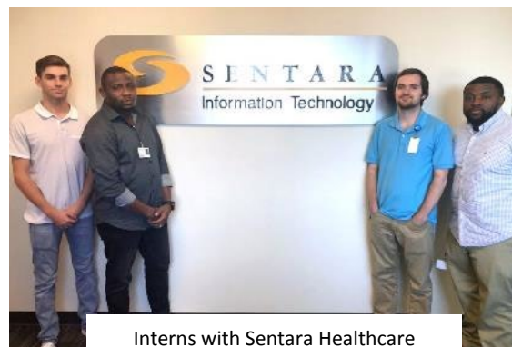
Interns with Sentara Healthcare