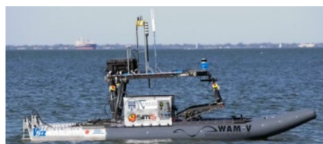
WAMV waterborne autonomous vehicle in Honolulu, HI