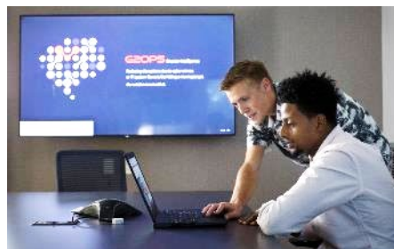
Interns with G2OPS