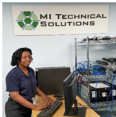
New Digital Entrant with MI Technical Solutions