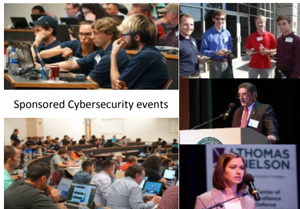
Sponsored Cybersecurity events